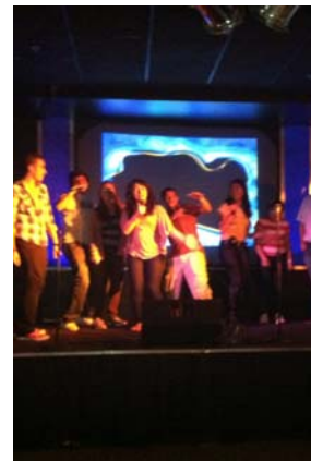
Students take the stage during EC Boston's Karaoke Night at Limelight !

All and all it was a fantastic night and all of the students had fun!