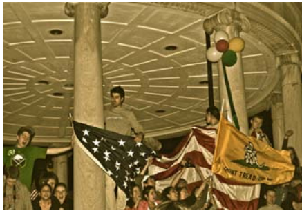
Santiago at the Boston Commons during the celebrations