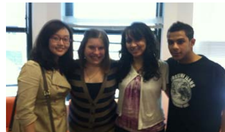
The EC Boston Newsletter Crew!